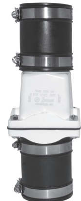
30-0021 Pvc Plastic

Consult Factory or local representative for state approvals